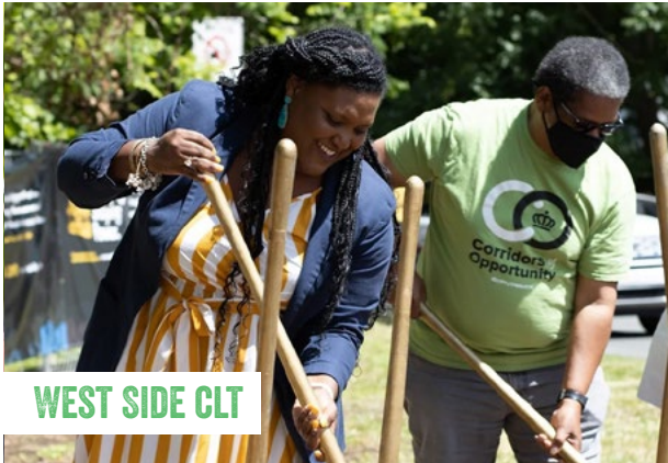
WEST SIDE CLT

West Side Community Land Trust (West Side CLT) is an organization that combats gentrification by preserving homes on the West Side of Charlotte. It creates staying power for long-time residents facing displacement and creates permanently affordable housing on the West Side and beyond. It's the first and only community land trust in Charlotte.