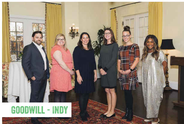
GOODWILL - INDY

Meet the Goodwill Foundation of Central & Southern Indiana, one of our COhatch Indianapolis Give Scholars! Goodwill strives to change lives every day by empowering others to increase their independence and reach their highest potential through education, health and employment. With existing barriers to employment, such as a limited education, disability, or criminal history, Goodwill employs and educates thousands of Hoosiers and provides them with wrap-around support.