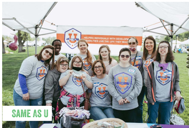
SAME AS U

The Goodwill Foundation plans to use COhatch locations to connect with people in the city they might not normally have a chance to meet. COhatch is grateful to have Goodwill as one of our Give Scholars for all of their community development efforts in our neighborhoods!