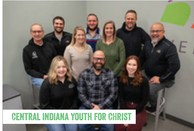
CENTRAL INDIANA YOUTH FOR CHRIST

Meet Central Indiana Youth For Christ (CIYFC), one of our COhatch Indianapolis GIVE Scholars! Their mission is to reach young people everywhere, working together with the local church and other like-minded partners to raise up lifelong followers of Jesus. Youth For Christ is a national organization with 140 chapters all around the US, with their Indianapolis chapter being one of the largest. Their organization is comprised of five groups dedicated to helping middle and high school students, institutionalized youth, inner-city youth, and young parents.