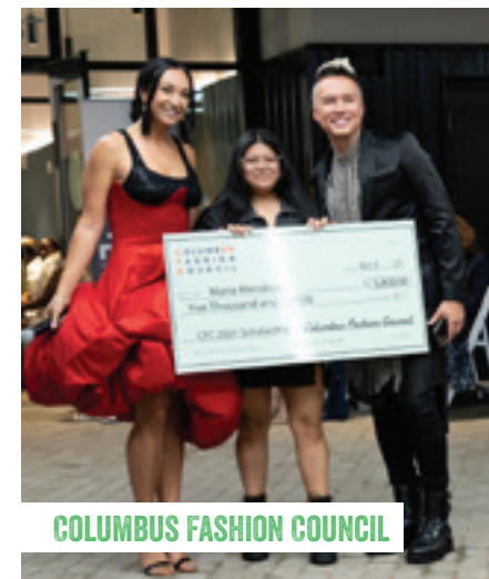
COLUMBUS FASHION COUNCIL

CancerFree KIDS is very grateful for their GIVE scholarship, so they can now host larger board meetings, as well as give their employees a place to work outside the office, since their office is small and not centrally located. We are so glad to have CancerFree KIDS as one of our GIVE Scholars!